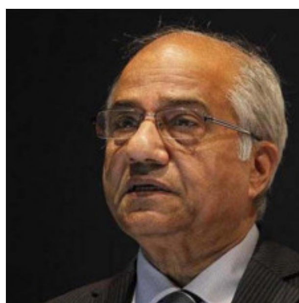
Justice Bellur Narayanaswamy Srikrishna Retired Judge of the Supreme Court of India Independent Arbitrator