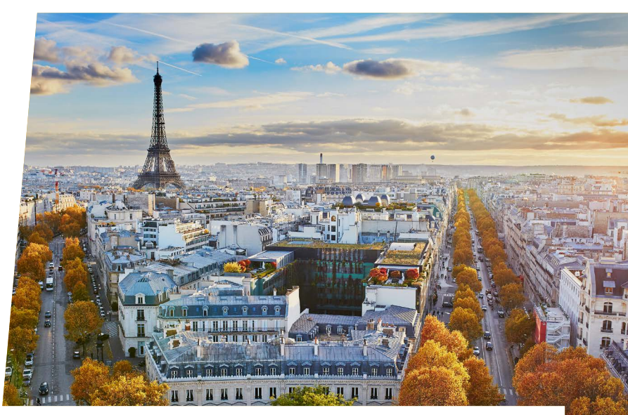
Tomorrow's hospitality A-Z: Navigating the future | Reed Smith 05