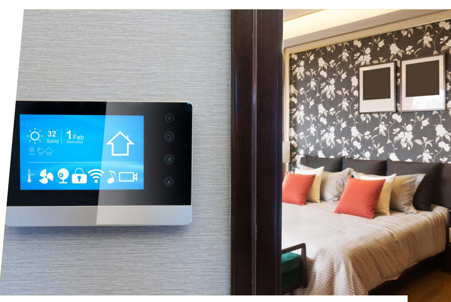
Tomorrow's hospitality A-Z: Navigating the future | Reed Smith 37