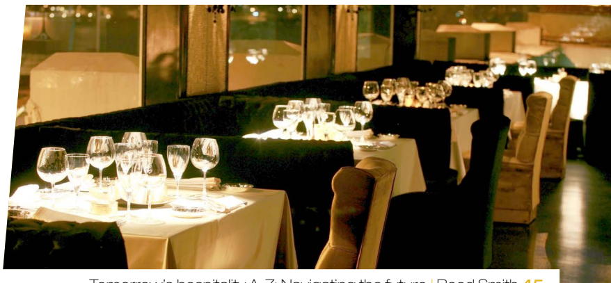
Tomorrow's hospitality A-Z: Navigating the future | Reed Smith 45

Related enforcement rights have been introduced as protection against being unfairly dismissed or subjected to detriment for reasons relating to the ban. To the extent that workers within the hospitality sector fall within the impacted group, it will be important to ensure that these clauses are no longer included in contracts and are not enforced if already in place. Giving workers the flexibility to take on a second job if this suits their personal circumstances may help hospitality businesses fill vacancies with those who would previously have been banned from working for another employer.