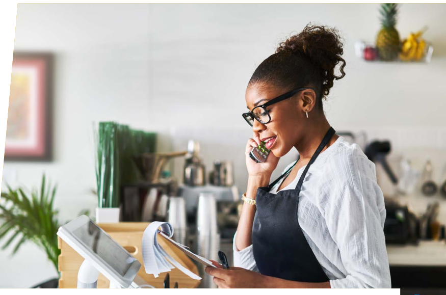
Tomorrow's hospitality A-Z: Navigating the future | Reed Smith 47

Zero-hour workers are useful in the hospitality industry as they allow flexibility to deal with fluctuating demand. Casual staff get the same protections as other staff, but in a few ways, they get extra protection, which means that employers cannot stop them from seeking and accepting work elsewhere.