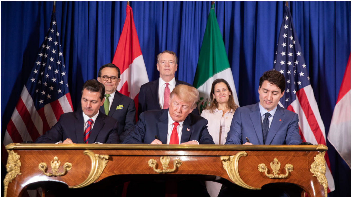
■ Outgoing Mexican President Enrique Peña Nieto, U.S. President Donald Trump, and Canadian Prime Minister Justin Trudeau sign the agreement during the G20 summit in Buenos Aires, Argentina, on November 30, 2018.

investments are safe from indirect expropriation and afforded other common investment treaty protections. This article provides a brief background on the significant investor protections NAFTA provided, then compares the same protections under the USMCA.