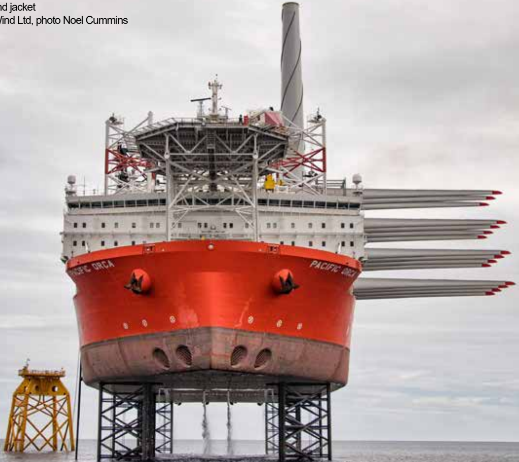
Pacific Orca Vessel and jacket

Widnes based SME Hutchinson Engineering Ltd successfully diversified their business into offshore wind. As a market leader in the fabrication and commissioning of mobile telecommunication masts, they pursued a detailed strategy to transfer their capability into the offshore wind secondary steel market. They have delivered secondary steel to Dudgeon, Burbo Bank Extension and Walney Extension offshore wind farms