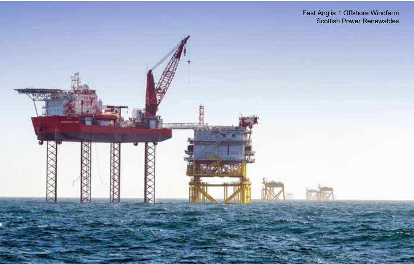
East Anglia 1 Offshore Windfarm Scottish Power Renewables

Since 2010, the UK has attracted 48 per cent of new investments, making