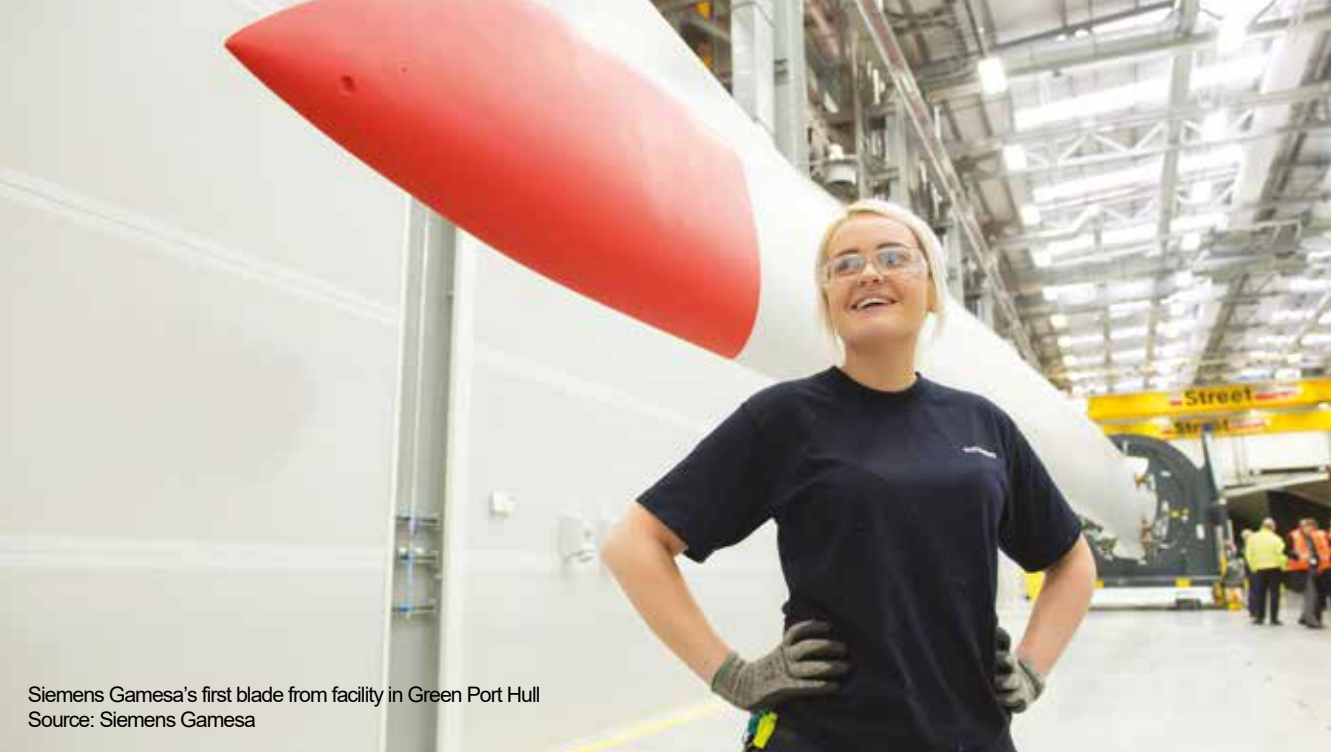
Siemens Gamesa's first blade from facility in Green Port Hull