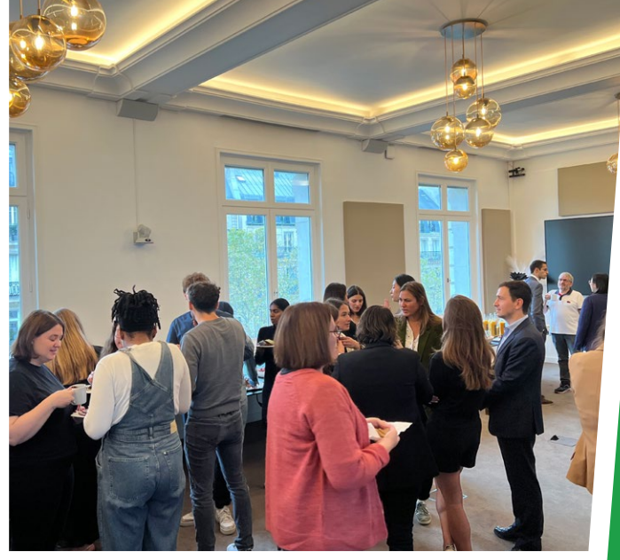
■ In Paris, we marked World Environment Day with an ecologically responsible breakfast.