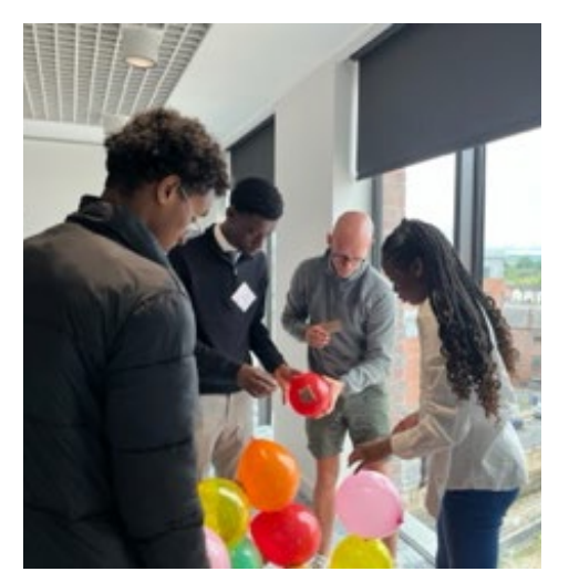
Speakers for Schools insight event