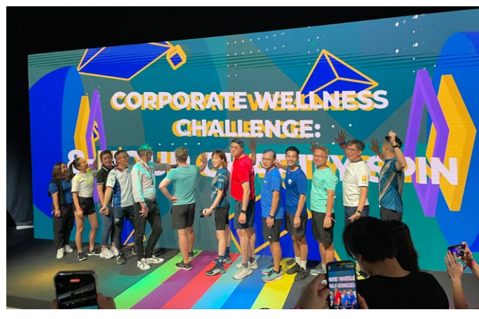
8-hour spin challenge