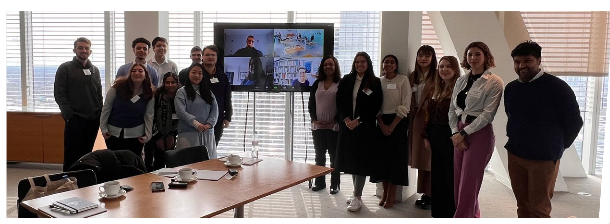
Event for students from the U.S. Kogod Business School