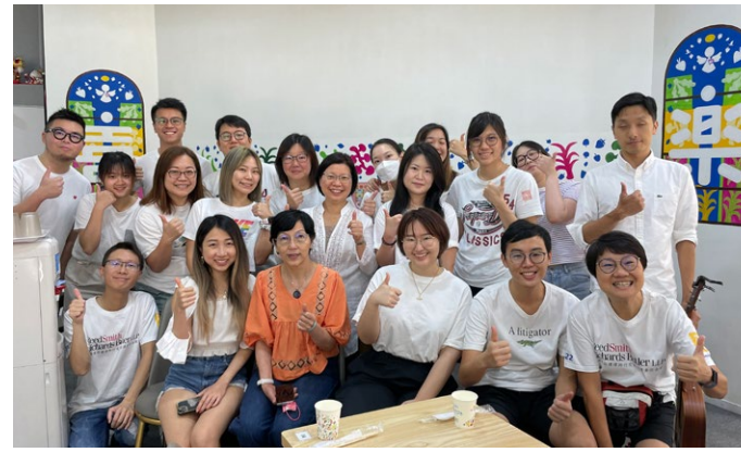
Holy Café community outreach