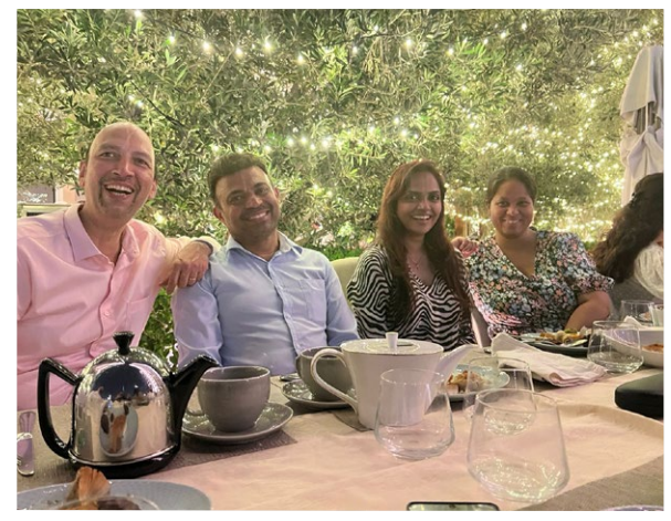
Our UAE offices enjoying their annual Iftar dinner

Iftar is one of the religious observances of Ramadan, often done as a community, where Muslim people gather to break their fast together. The meal is taken just after the call to the Maghrib prayer around sunset.