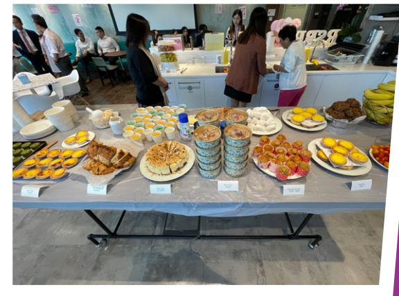
Breakfast event for Pink Revolution